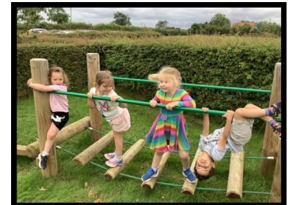
Having fun on the trim trail.