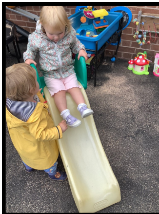
Fun in the free flow.