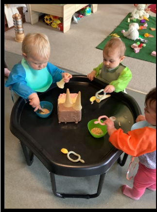
Ice cream sensory tray.