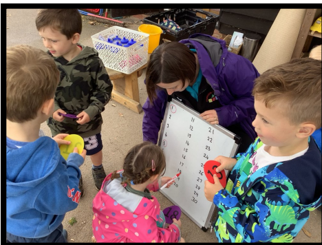
Number hunt recognition.