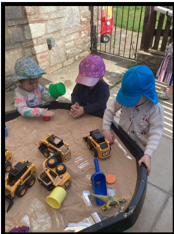
Sand tray fun.