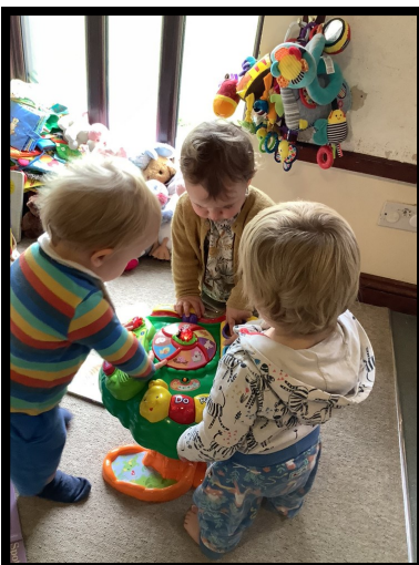
Exploring the ICT toys together.