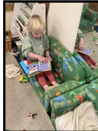
Enjoying relaxing with a book.