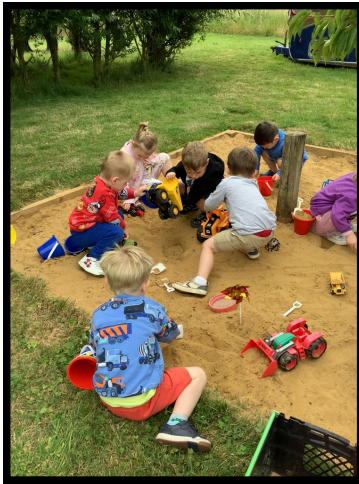
Large sandpit fun.