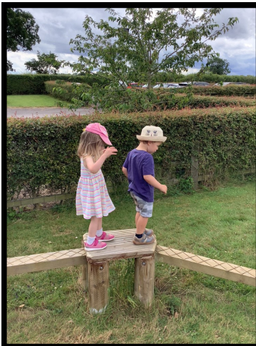
Practicing our balancing on the trim trail.