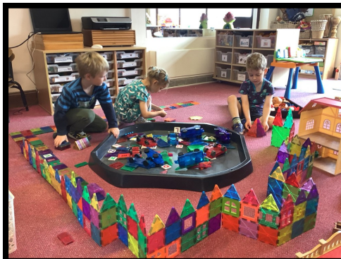
Getting creative with the magnetic tiles.