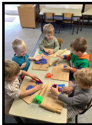
Getting creative with play dough.