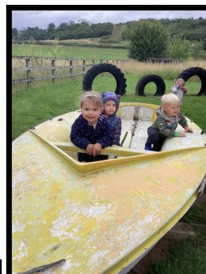
Fun exploring the boat.