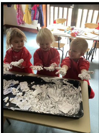
Shaving foam fun.