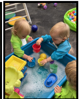
Waterplay in the garden.