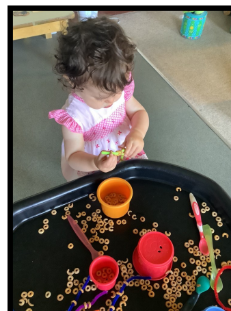
Practising our fine motor skills.