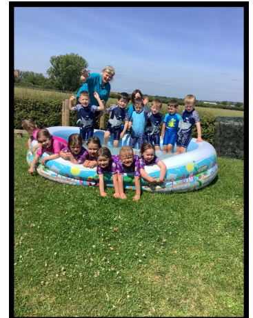
Having a splashing time!