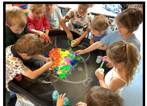
Creating our Rainbow Fish.