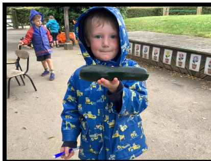
We picked our first courgette!