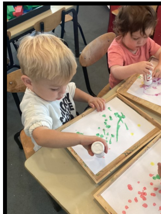
Mark making with the dabbers.