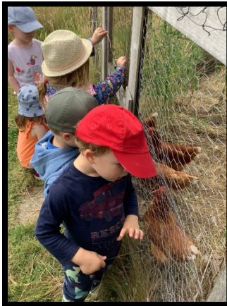
Checking our Nursery chickens.