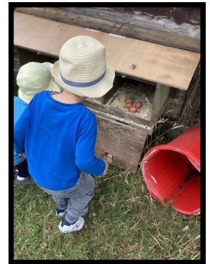
Collecting the eggs.