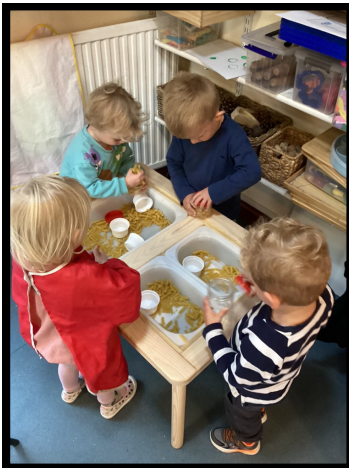
Emptying and filling pots.