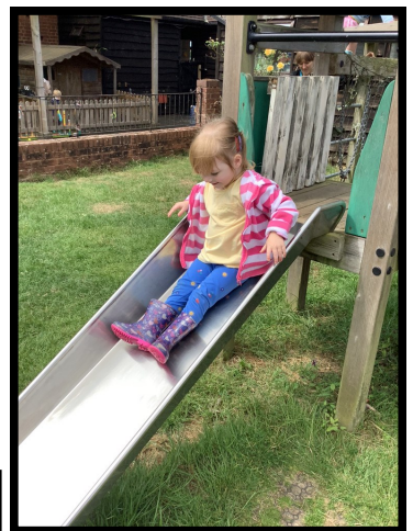
Having fun in the garden.