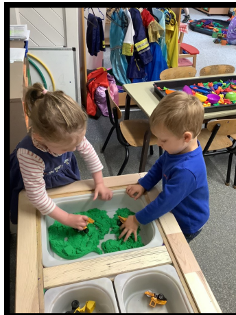
Exploring the sensory tray.