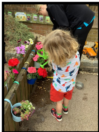
Watering our flowers.