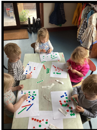
Getting creative with stickers.