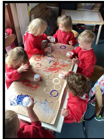
Making marks and patterns.