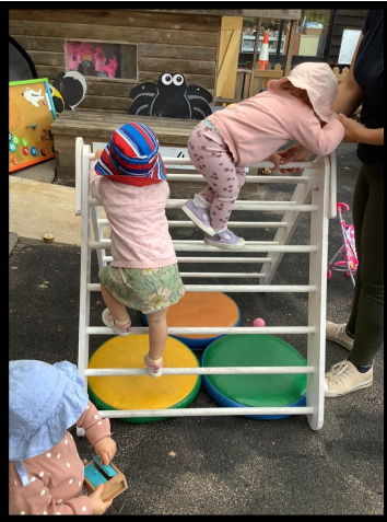
Practicing our climbing.