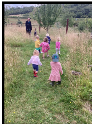
Enjoying a walk in the meadow.