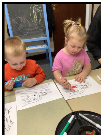
Colouring in our holiday transport pictures.