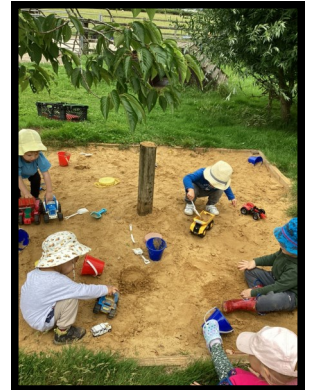
Having fun in the large sand pit.