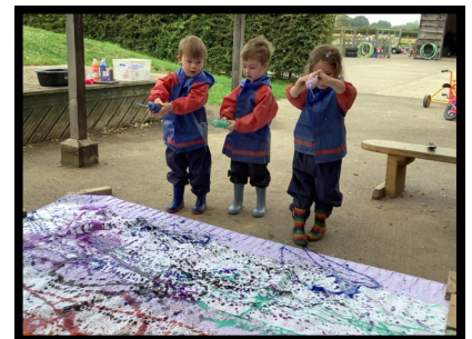
Creating a large group painting.