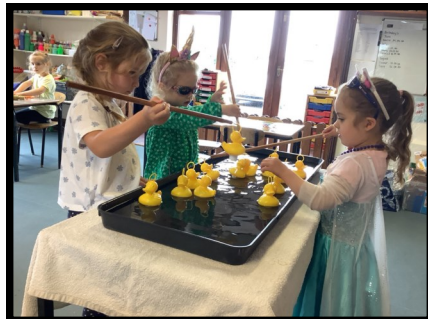
Hook a Duck.