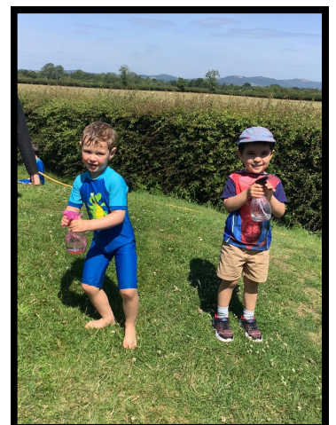
Having fun in the sunshine.