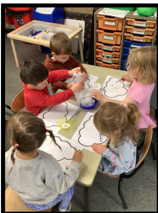
Creating our weather pictures.