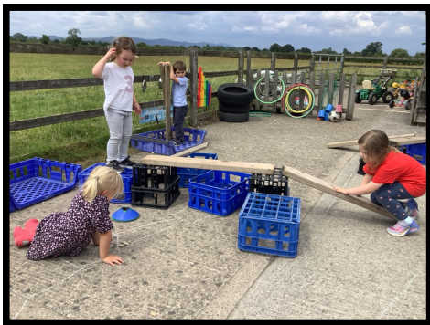
Building structures together.