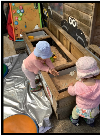
Exploring the sand tray together.