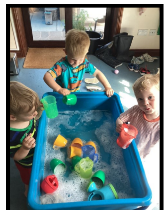
Cooling off with water play.