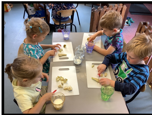
Cutting up fruit for our snack .